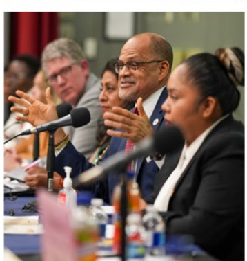
Our Schools Speak Your Language